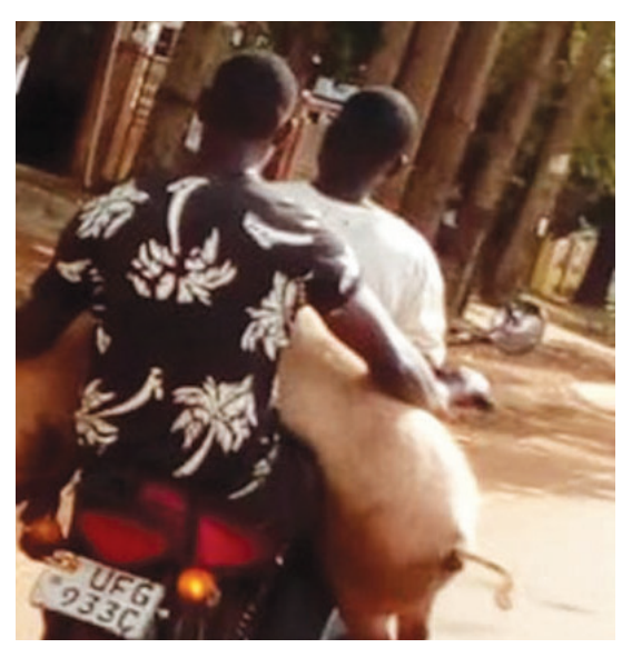
Figure 1 Animal being carried stressfully on a motor bicycle in Uganda

From observations and literature there are various forms of animal cruelty (Ssanni, 2017). This implies that there is animal welfare and rights breach (Nassbaum, 2006), as is also shown in Figure 1. With the current economic situation, emphasis is put on profit maximization than animal welfare as is reported by Rahman et al (2005) amidst presence of Acts towards improving animal welfare and right. This analysis tackles a number of Acts as listed above, but which are quite old and therefore may not match the current conditions.